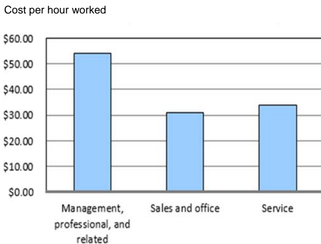
Chart 1. Employer costs per hour worked for total compensation: selected major occupational groups, state and local government workers, September 2015