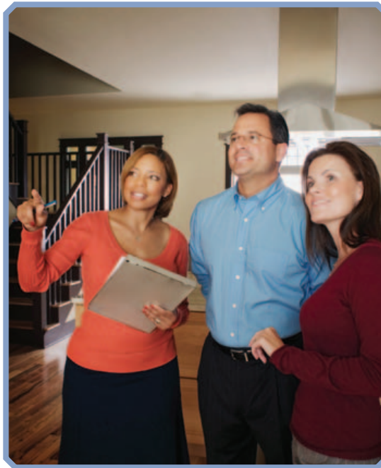
Real estate agents show properties to prospective buyers.

Real estate brokers and agents must be at least 18 years old and have a high school diploma. Some firms prefer to hire workers who have a college degree. Many real estate agents start as sales trainees in a brokerage firm, learning on the job from more experienced agents.