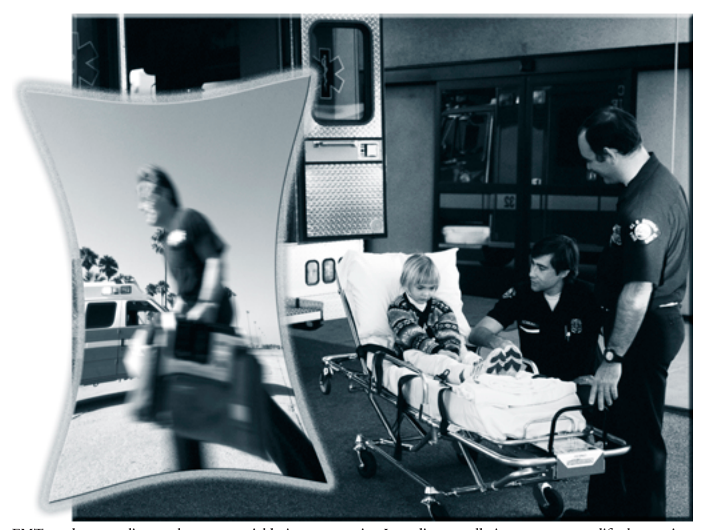
EMTs and paramedics need to react quickly in emergencies. In reality, not all circumstances are life threatening.

the nurses, and monitoring patients' conditions has an enormous amount of intervention associated with it," he says. "Also, drugs are administered by the nursing staff, and this must be done right. Physicians might write inappropriate medical orders, and nurses must catch these mistakes."