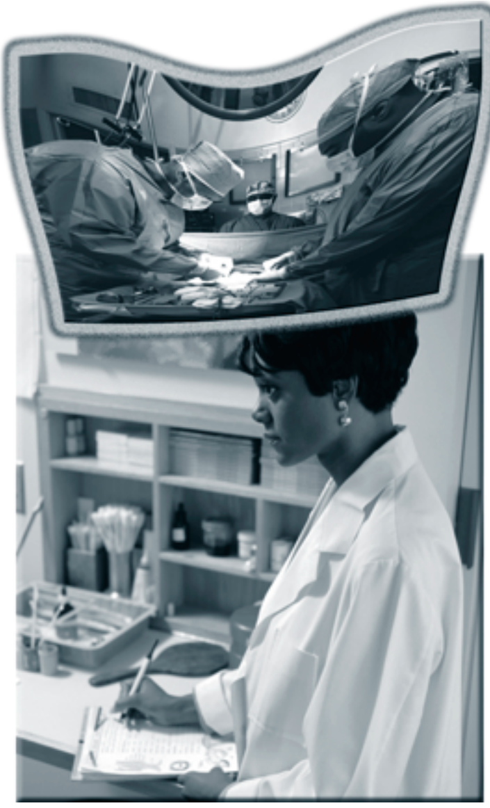
TV dramas focus on action, often overlooking routine job tasks like paperwork.

discharge specialists—would normally do."