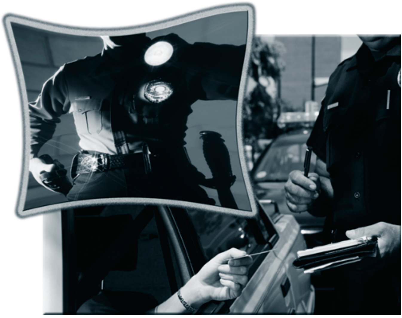
Police work is more than the tough-as-nails image that television sometimes portrays.

case at a time until it is resolved—by the end of the episode—these workers in real life have little autonomy and might work diligently for years on several cases, without a breakthrough. "Crimes are typically extremely complex and difficult to solve," Townsend says. "Many don't get solved."