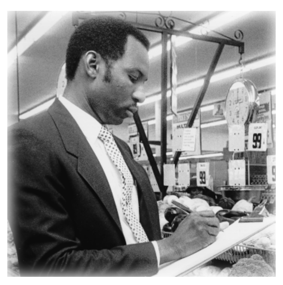
Managers, like other temporary workers, often help client companies during their busy seasons.

ment a plan of action and be accountable for effecting change," he says. "Consultants are inherently removed from the action-oriented results their clients long for. Their focus is on issuing reports."