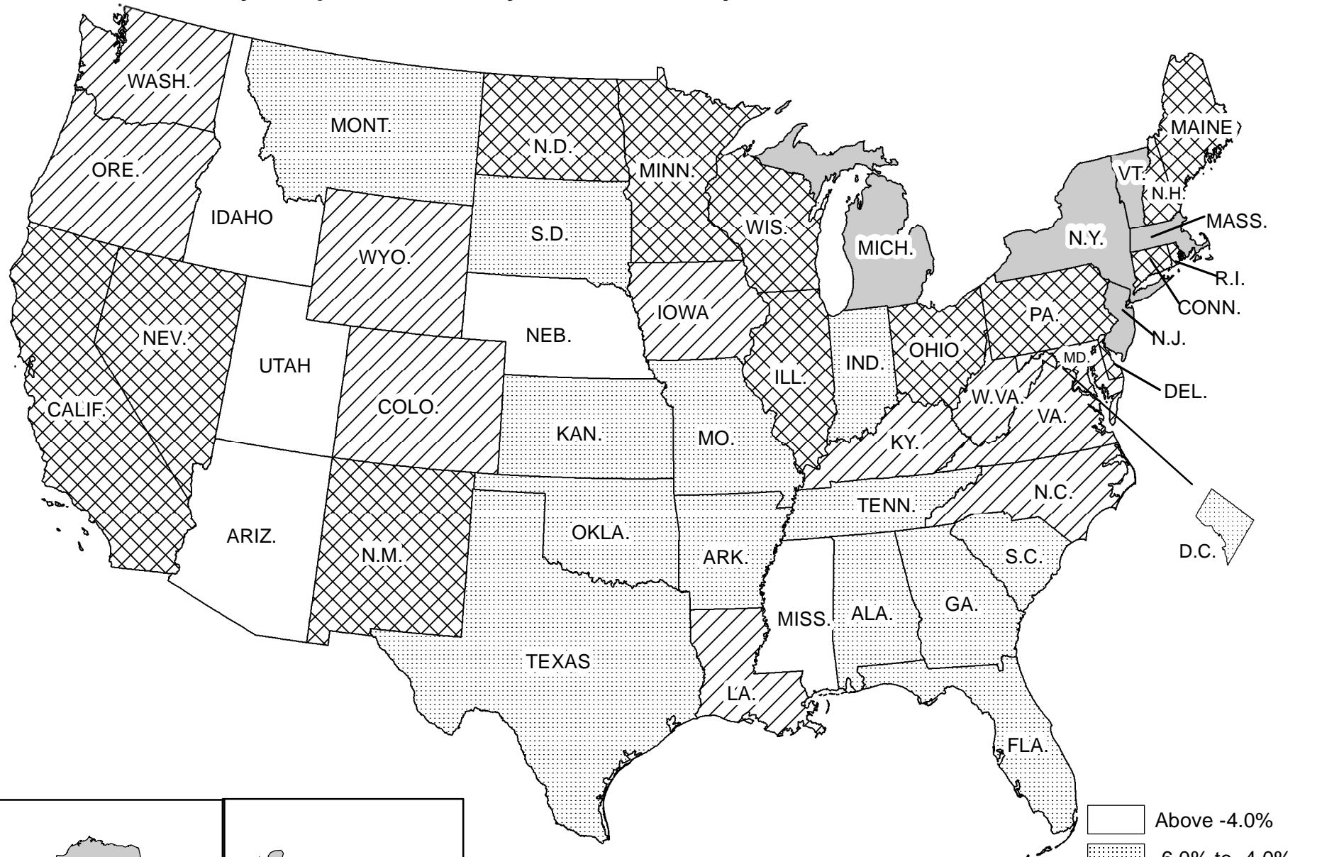
Map 2. Percentage change in nonfarm employment by state, seasonally adjusted, July 2019 - July 2020