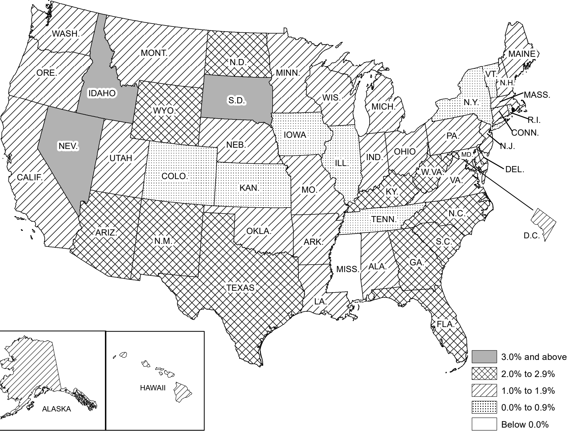
Map 2. Percentage change in nonfarm employment by state, seasonally adjusted, December 2022 - December 2023